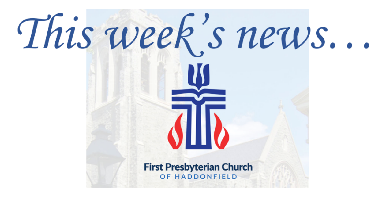
Dear << Test First Name >>